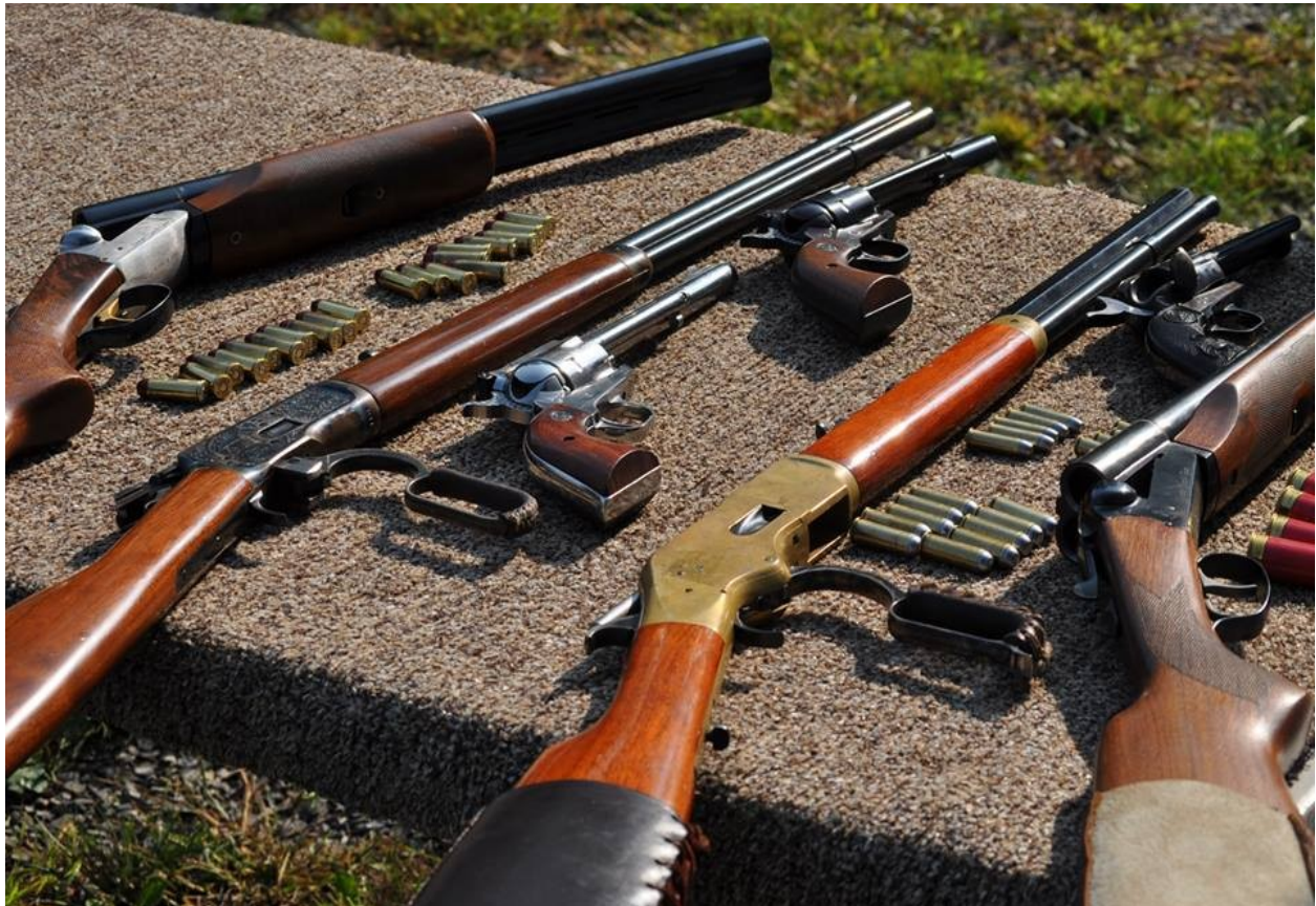
Utica, Michigan