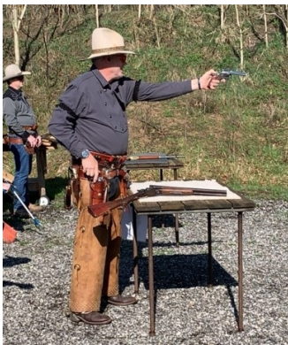
Wildcat Maverick timed by Bad Brass and the new mine prop wall.