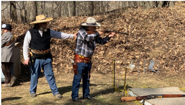
Fenton Leadfoot Luke watching Bad Brass burndown a stage.