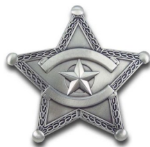
Sinola Kid Captain Wolverine Rangers