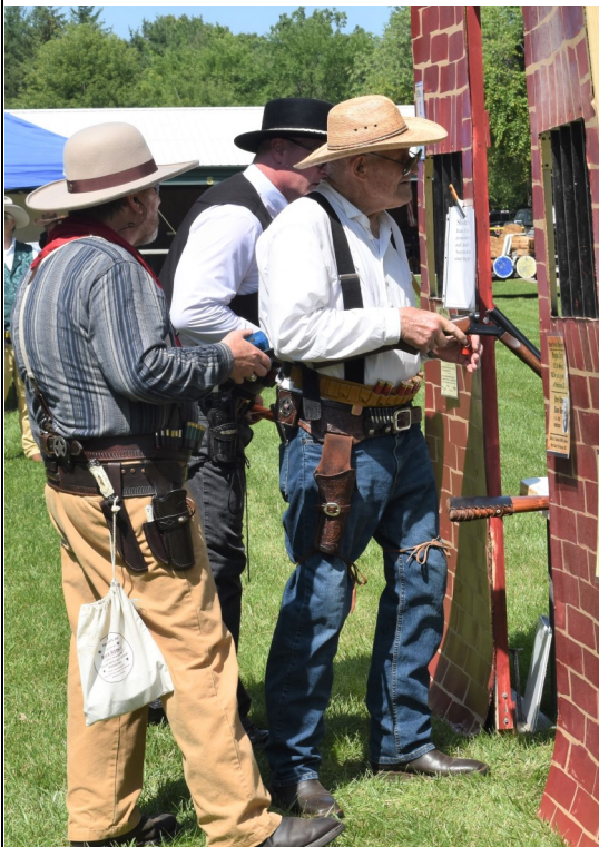
Pop A Shot and Reverend MissAlot