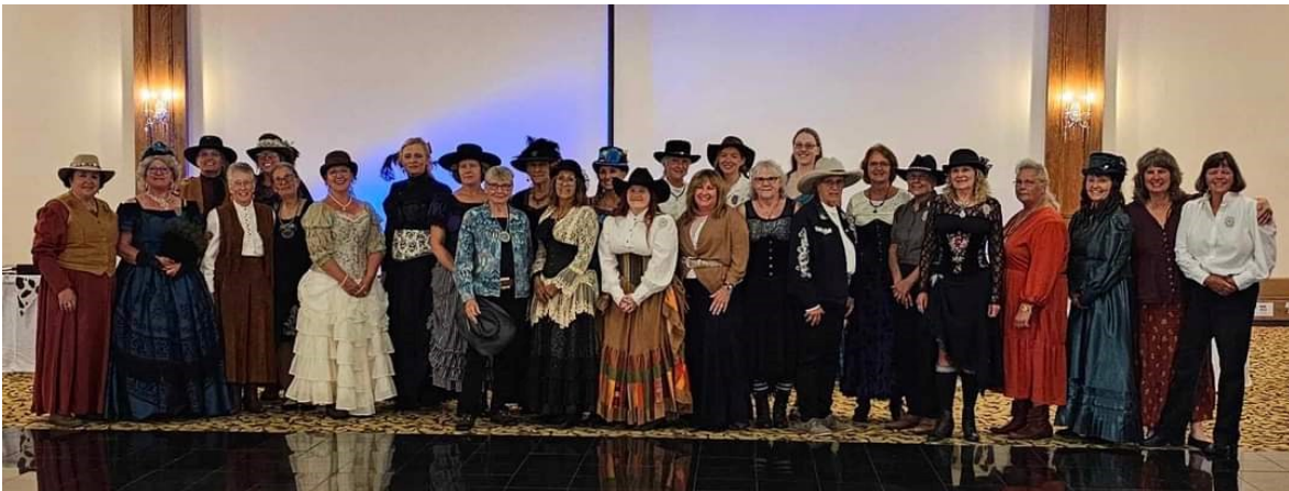
The Ladies at Range War