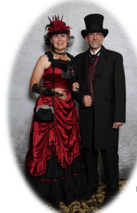
Rude Dude Best Dressed Man