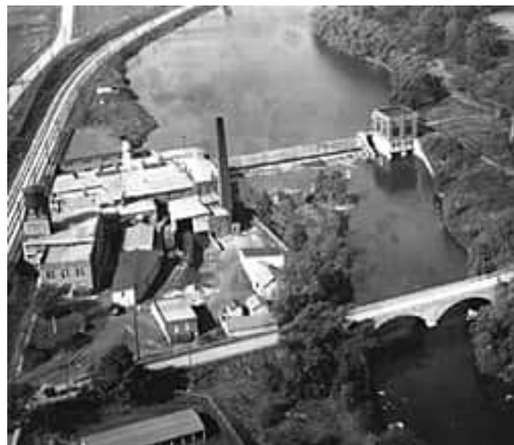
The dam and paper company in the early 1900's