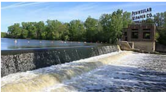
The dam in 2010